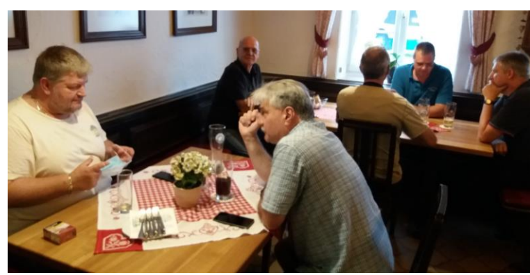
Finally, I would like to introduce the team behind the Munich meeting. These are: