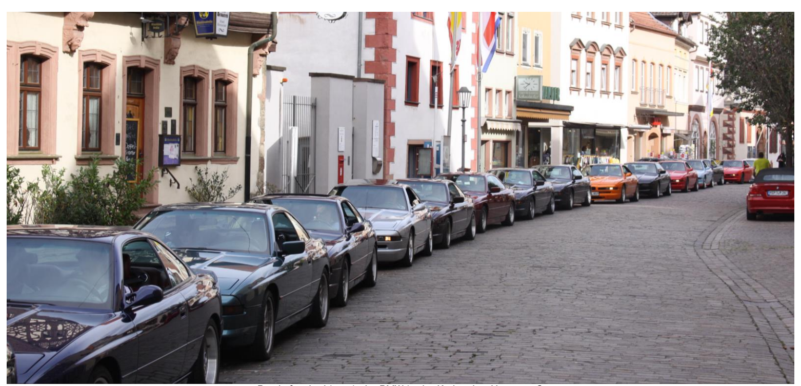
Ready for the big exit the BMW in the Karlstadter Hauptstraße