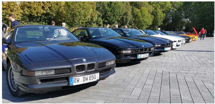
After all 8th cars were parked, and that can take a while... we could drink a coffee.