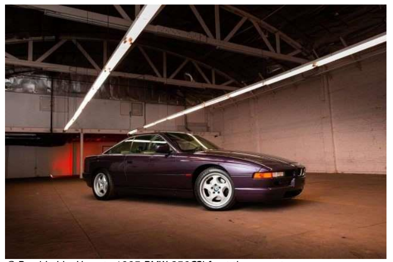
1995 BMW 850CSi front three-quarter

Hagerty price guide values for the 850CSi have more than doubled in the past five years as collectors have caught on, and the condition 1 value is now $208,000. Will the model continue to appreciate? Given the CSi's pillarless styling, big V-12, manual transmission, and elegant styling — all qualities increasingly absent from the marketplace — it looks likely.