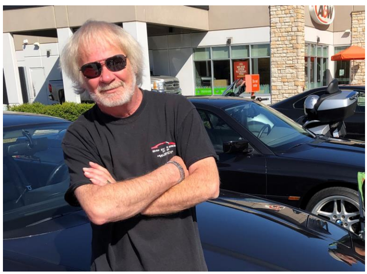
Doors open at 9AM. Bring your own snacks/beverages/lunch. Meet other E31 owners and discuss common problems. Come to work on your car, help someone work on their car or just socialize!