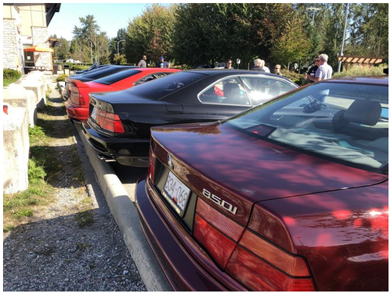
NEXT EVENT: The next BC8s event is Saturday, September 12th WrenchFest at Wuffer's Garage & Spa- 19950 46 Avenue Langley, BC. All E31 owners are welcome. Social distancing will be in effect. Bring a folding chair.