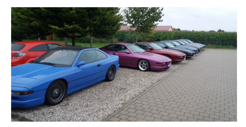
In recent years, friendships have developed among the participants who are regularly at the Munich meetings.

This time, in addition to the regular participants, newcomers were also there.